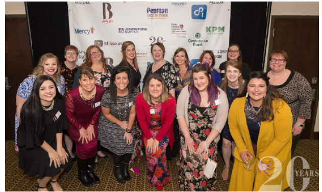
Teachers celebrate by taking a group photo with 417 People Pics.