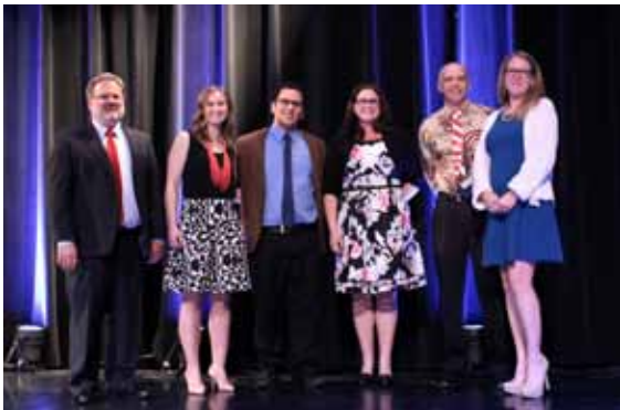
Recognition of Board members' service