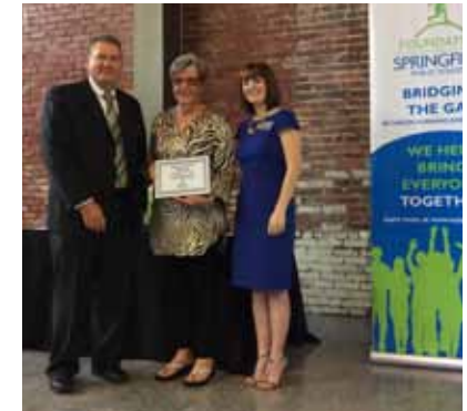
Top Left Photo: Recognizing the William Thomas Pearson Debate Scholarship Fund at the Donor Appreciation Luncheon