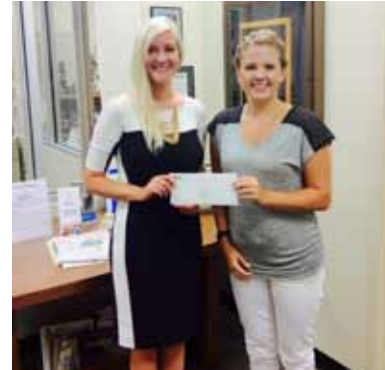
Pictured on right: Check presentation from Missouri Employers Mutual's Springfield Community Involvement Committee for the Back to School Program