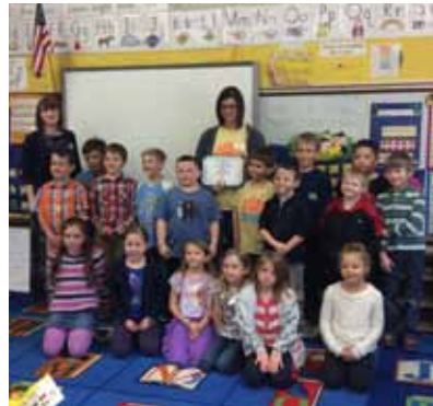
Pictured on left: Grant visit with the FSPS Board at Cherokee Middle School / Check presentation for Turners Reading Award