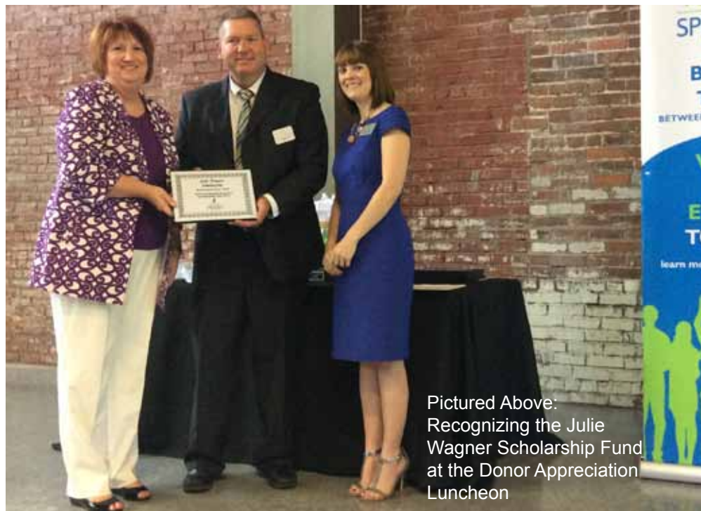
Pictured Above: Recognizing the Julie Wagner Scholarship Fund at the Donor Appreciation Luncheon

IB Art Show Fund- Established to assist the IB programs in each of the Springfield Public Schools with expenses for an annual city-wide IB art show